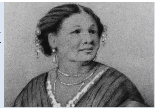
Mary Seacole, one of the many figures named in the poem.

Noticeably the poet emphasises how we often celebrate our national or cultural history, without looking at the history and culture of those we were in conflict with.